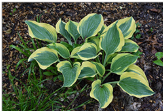
Liberty Hosta