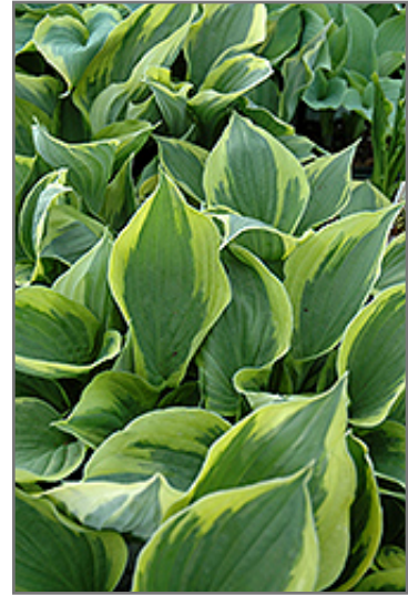
Twilight Hosta foliage