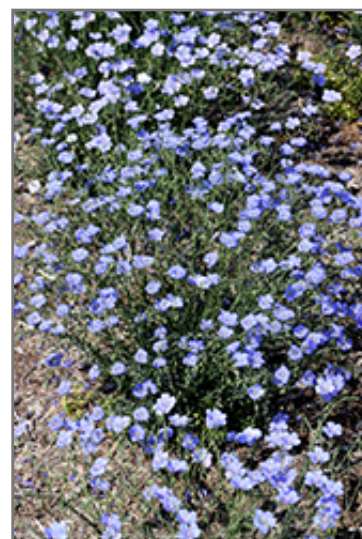
Sapphire Perennial Flax in bloom