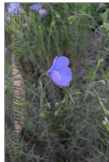
Sapphire Perennial Flax