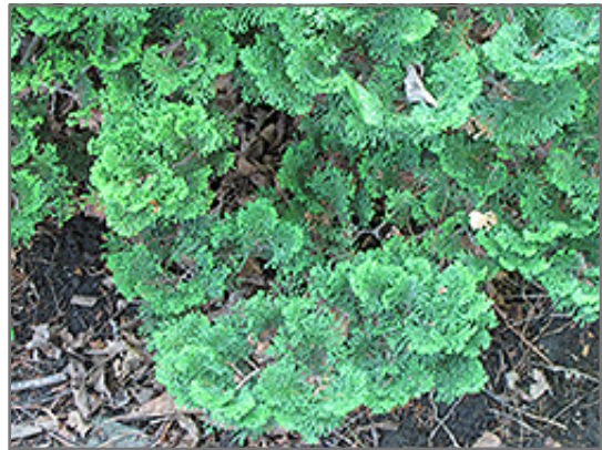
Nana Dwarf Hinoki Falsecypress foliage