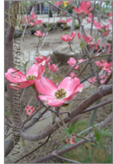
Cherokee Chief Dogwood Flower

This tree does best in full sun to partial shade. It requires an evenly moist well-drained soil for optimal growth, but will die in standing water. It is very fussy about its soil conditions and must have rich, acidic soils to ensure success, and is subject to chlorosis (yellowing) of the foliage in alkaline soils. It is quite intolerant of urban pollution, therefore inner city or urban streetside plantings are best avoided, and will benefit from being planted in a relatively sheltered location. Consider applying a thick mulch around the root zone in winter to protect it in exposed locations or colder microclimates. This is a selection of a native North American species.