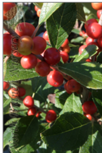
Red Sprite Winterberry Holly

This shrub does best in full sun to partial shade. It prefers to grow in moist to wet soil, and will even tolerate some standing water. It is very fussy about its soil conditions and must have rich, acidic soils to ensure success, and is subject to chlorosis (yellowing) of the foliage in alkaline soils. It is somewhat tolerant of urban pollution. Consider applying a thick mulch around the root zone in winter to protect it in exposed locations or colder microclimates. This is a selection of a native North American species.