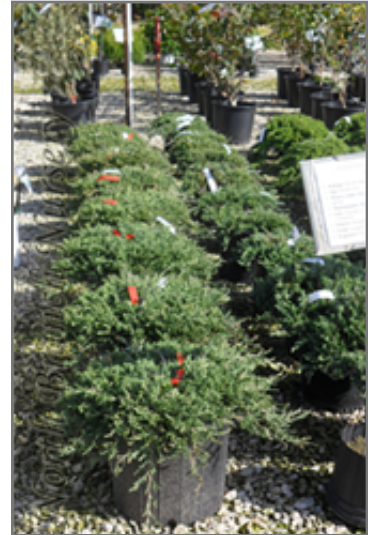
Blue Rug Juniper

This shrub does best in full sun to partial shade. It is very adaptable to both dry and moist growing conditions, but will not tolerate any standing water. It is considered to be drought-tolerant, and thus makes an ideal choice for a low-water garden or xeriscape application. It is not particular as to soil type or pH. It is highly tolerant of urban pollution and will even thrive in inner city environments. This is a selection of a native North American species.