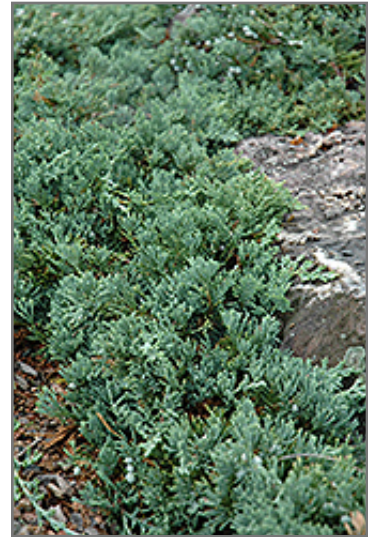
Blue Rug Juniper