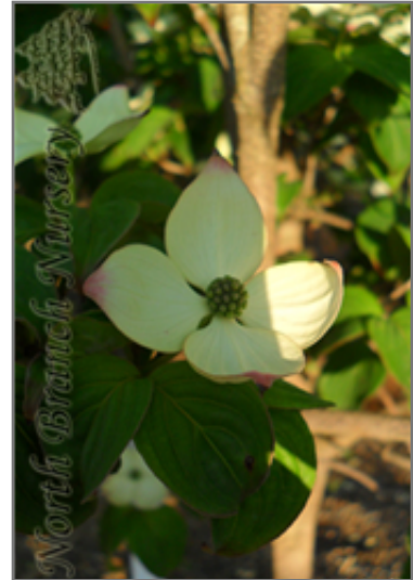
Flowers on Heart Throb Dogwood

This tree does best in full sun to partial shade. It does best in average to evenly moist conditions, but will not tolerate standing water. It is very fussy about its soil conditions and must have rich, acidic soils to ensure success, and is subject to chlorosis (yellowing) of the foliage in alkaline soils. It is somewhat tolerant of urban pollution, and will benefit from being planted in a relatively sheltered location. Consider applying a thick mulch around the root zone in winter to protect it in exposed locations or colder microclimates. This is a selected variety of a species not originally from North America.