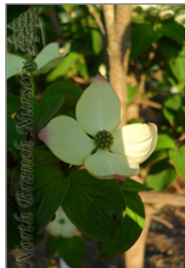
Flowers on Heart Throb Dogwood

This tree does best in full sun to partial shade. It does best in average to evenly moist conditions, but will not tolerate standing water. It is very fussy about its soil conditions and must have rich, acidic soils to ensure success, and is subject to chlorosis (yellowing) of the foliage in alkaline soils. It is somewhat tolerant of urban pollution, and will benefit from being planted in a relatively sheltered location. Consider applying a thick mulch around the root zone in winter to protect it in exposed locations or colder microclimates. This is a selected variety of a species not originally from North America.