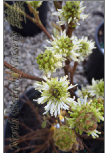
Dwarf Fothergilla

Dwarf Fothergilla is recommended for the following landscape applications;