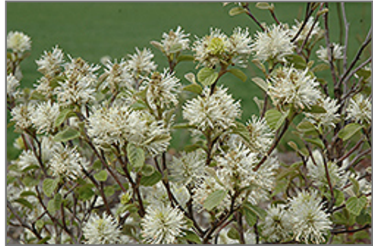
Dwarf Fothergilla flowers

This shrub does best in full sun to partial shade. It requires an evenly moist well-drained soil for optimal growth, but will die in standing water. It is not particular as to soil type, but has a definite preference for acidic soils, and is subject to chlorosis (yellowing) of the foliage in alkaline soils. It is somewhat tolerant of urban pollution. This species is native to parts of North America.