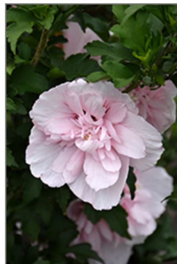
Pink Chiffon Rose of Sharon flowers