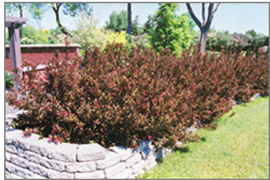
Wine and Roses Weigela