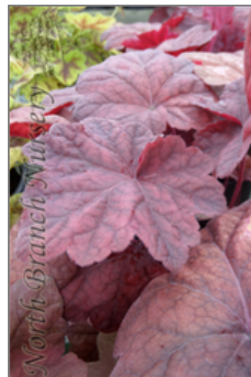
Lava Lamp Coral Bell

Lava Lamp Coral Bells is a fine choice for the garden, but it is also a good selection for planting in outdoor pots and containers. With its upright habit of growth, it is best suited for use as a 'thriller' in the 'spiller-thriller-filler' container combination; plant it near the center of the pot, surrounded by smaller plants and those that spill over the edges. Note that when growing plants in outdoor containers and baskets, they may require more frequent waterings than they would in the yard or garden.