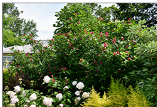
Aphrodite Sweetshrub in bloom