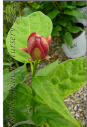
Aphrodite Sweetshrub

This shrub does best in full sun to partial shade. It is very adaptable to both dry and moist locations, and should do just fine under average home landscape conditions. It is not particular as to soil type or pH. It is somewhat tolerant of urban pollution. This particular variety is an interspecific hybrid.