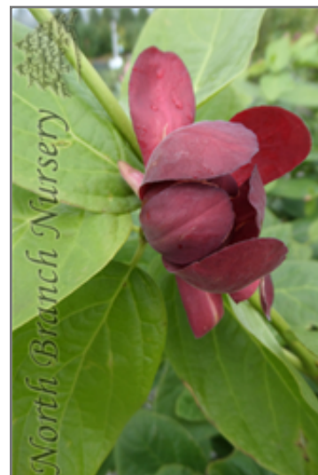
Aphrodite Sweetshrub

Aphrodite Sweetshrub is recommended for the following landscape applications;