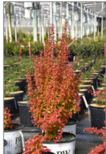
Sunjoy Orange Pillar Japanese Barberry