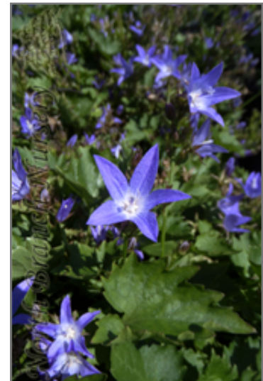
Blue Waterfall Bellflower