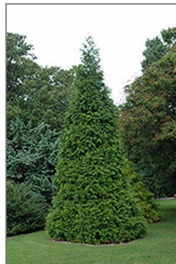
Green Giant Arborvitae

Green Giant Arborvitae will grow to be about 30 feet tall at maturity, with a spread of 13 feet. It has a low canopy, and should not be planted underneath power lines. It grows at a fast rate, and under ideal conditions can be expected to live for 50 years or more.