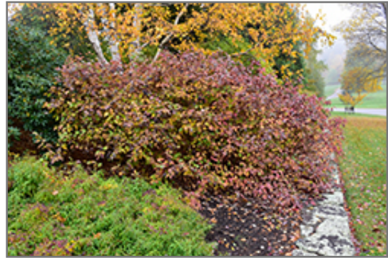
Bailey Red-Twig Dogwood in fall