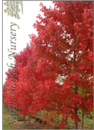
October Glory Fall Color