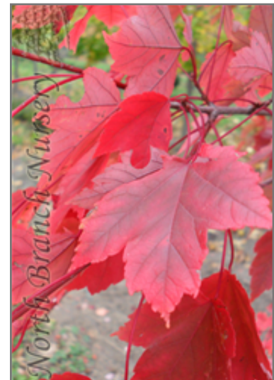
October Glory Fall Color