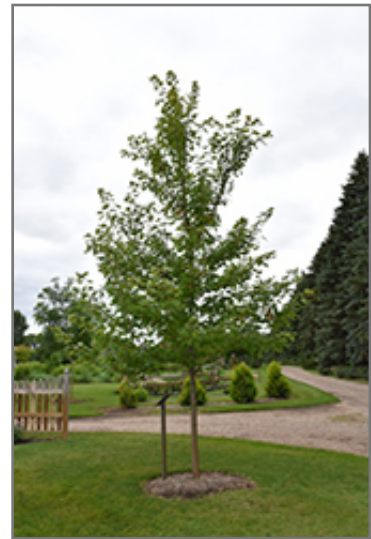
Matador Maple