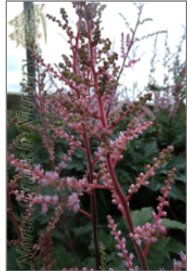
Delft Lace Astilbe

Delft Lace Astilbe is recommended for the following landscape applications;