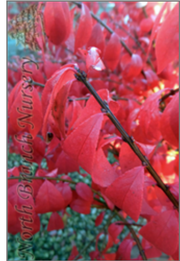
Burning Bush Fall Color

This shrub performs well in both full sun and full shade. It is very adaptable to both dry and moist locations, and should do just fine under average home landscape conditions. It is not particular as to soil type or pH. It is highly tolerant of urban pollution and will even thrive in inner city environments. This is a selected variety of a species not originally from North America.