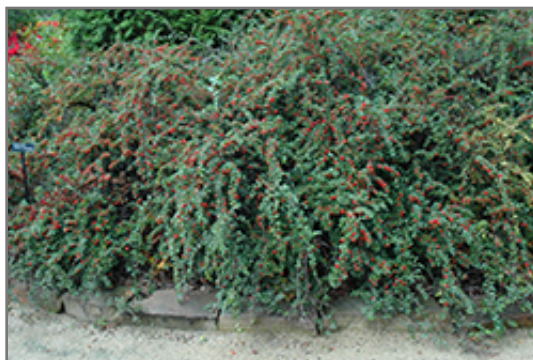
Cranberry Cotoneaster