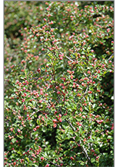
Cranberry Cotoneaster flowers

This shrub does best in full sun to partial shade. It is very adaptable to both dry and moist growing conditions, but will not tolerate any standing water. It is not particular as to soil type or pH, and is able to handle environmental salt. It is highly tolerant of urban pollution and will even thrive in inner city environments. This species is not originally from North America.