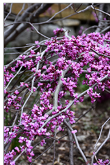
Ruby Falls Weeping Redbud flowers