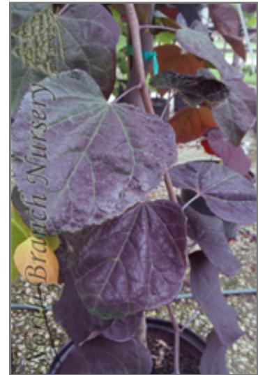
Foliage on Ruby Falls Redbud

This shrub does best in full sun to partial shade. It prefers to grow in average to moist conditions, and shouldn't be allowed to dry out. It is not particular as to soil type or pH. It is highly tolerant of urban pollution and will even thrive in inner city environments, and will benefit from being planted in a relatively sheltered location. Consider applying a thick mulch around the root zone in winter to protect it in exposed locations or colder microclimates. This is a selection of a native North American species.