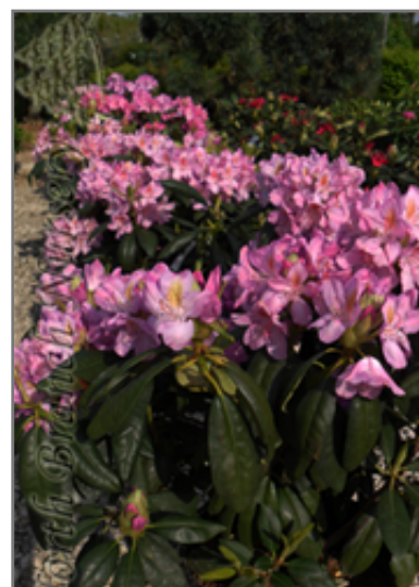
Roseum Elegans Rhododendron