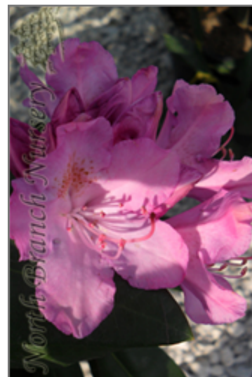
Blooms on Roseum Elegans Rhodo