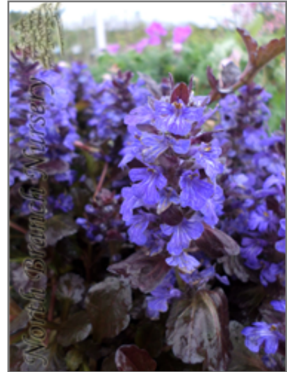
Black Scallop Flowers

This plant does best in partial shade to shade. It does best in average to evenly moist conditions, but will not tolerate standing water. It is not particular as to soil type or pH. It is somewhat tolerant of urban pollution. Consider covering it with a thick layer of mulch in winter to protect it in exposed locations or colder microclimates. This is a selected variety of a species not originally from North America. It can be propagated by division; however, as a cultivated variety, be aware that it may be subject to certain restrictions or prohibitions on propagation.