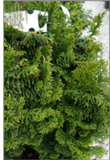
Kosteri Hinoki Falsecypress

Kosteri Hinoki Falsecypress makes a fine choice for the outdoor landscape, but it is also well-suited for use in outdoor pots and containers. Because of its height, it is often used as a 'thriller' in the 'spiller-thriller-filler' container combination; plant it near the center of the pot, surrounded by smaller plants and those that spill over the edges. It is even sizeable enough that it can be grown alone in a suitable container. Note that when grown in a container, it may not perform exactly as indicated on the tag - this is to be expected. Also note that when growing plants in outdoor containers and baskets, they may require more frequent waterings than they would in the yard or garden.