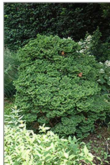
Kosteri Hinoki Falsecypress