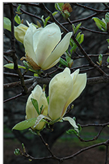
Yellow Lantern Magnolia flowers

This tree does best in full sun to partial shade. It requires an evenly moist well-drained soil for optimal growth, but will die in standing water. It is not particular as to soil type, but has a definite preference for acidic soils. It is quite intolerant of urban pollution, therefore inner city or urban streetside plantings are best avoided. Consider applying a thick mulch around the root zone in winter to protect it in exposed locations or colder microclimates. This particular variety is an interspecific hybrid.