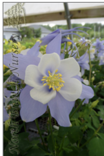
Songbird Bluebird Columbine

Songbird Blue Bird Columbine is a fine choice for the garden, but it is also a good selection for planting in outdoor pots and containers. It is often used as a 'filler' in the 'spiller-thriller-filler' container combination, providing a mass of flowers against which the larger thriller plants stand out. Note that when growing plants in outdoor containers and baskets, they may require more frequent waterings than they would in the yard or garden.