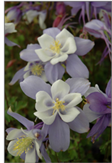
Songbird Blue Bird Columbine flowers