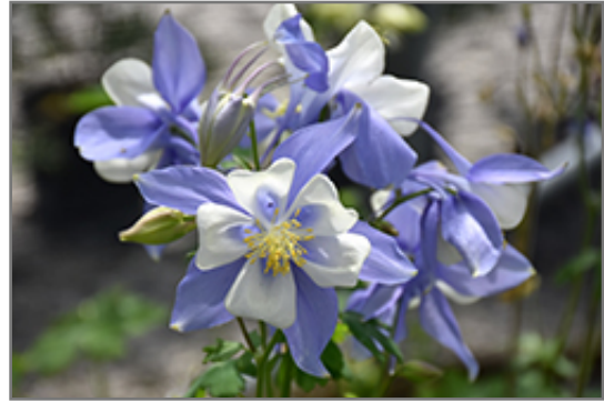
Songbird Blue Bird Columbine flowers