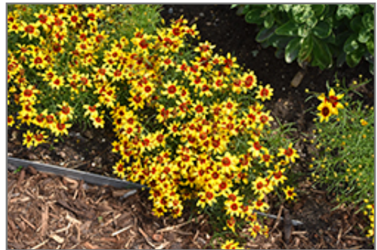
Curry Up Tickseed in bloom