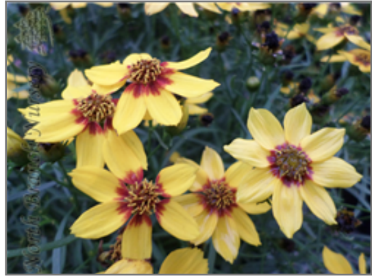
Curry Up Coreopsis

Curry Up Tickseed will grow to be about 15 inches tall at maturity, with a spread of 24 inches. Its foliage tends to remain dense right to the ground, not requiring facer plants in front. It grows at a medium rate, and under ideal conditions can be expected to live for approximately 8 years. As an herbaceous perennial, this plant will usually die back to the crown each winter, and will regrow from the base each spring. Be careful not to disturb the crown in late winter when it may not be readily seen!