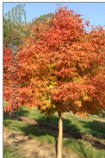
Three Flower Maple Fall Color

Three Flowered Maple will grow to be about 30 feet tall at maturity, with a spread of 30 feet. It has a low canopy with a typical clearance of 5 feet from the ground, and should not be planted underneath power lines. It grows at a slow rate, and under ideal conditions can be expected to live for 70 years or more.