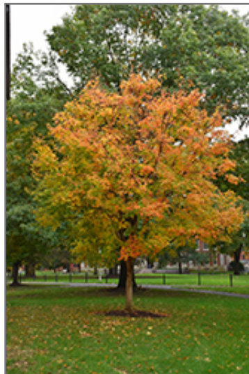
Three Flowered Maple in fall