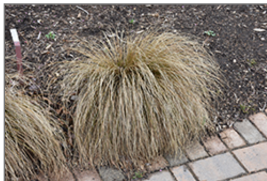
Prairie Fire Sedge

Prairie Fire Sedge is recommended for the following landscape applications;