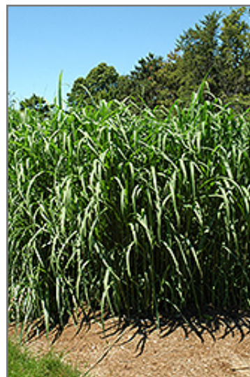
Giant Silver Grass

Giant Silver Grass will grow to be about 10 feet tall at maturity extending to 12 feet tall with the flowers, with a spread of 5 feet. It tends to be leggy, with a typical clearance of 1 foot from the ground, and should be underplanted with lower-growing perennials. It grows at a medium rate, and under ideal conditions can be expected to live for approximately 20 years. As an herbaceous perennial, this plant will usually die back to the crown each winter, and will regrow from the base each spring. Be careful not to disturb the crown in late winter when it may not be readily seen!