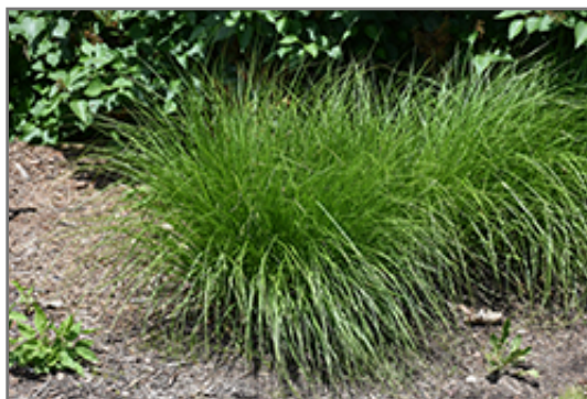
Fox Sedge