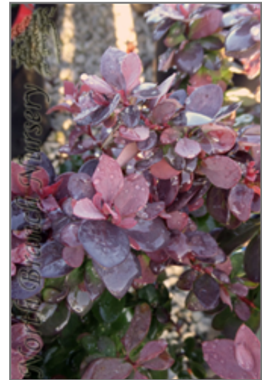
Concorde Barberry

Concorde Japanese Barberry makes a fine choice for the outdoor landscape, but it is also well-suited for use in outdoor pots and containers. It is often used as a 'filler' in the 'spiller-thriller-filler' container combination, providing a mass of flowers and foliage against which the thriller plants stand out. Note that when grown in a container, it may not perform exactly as indicated on the tag - this is to be expected. Also note that when growing plants in outdoor containers and baskets, they may require more frequent waterings than they would in the yard or garden.