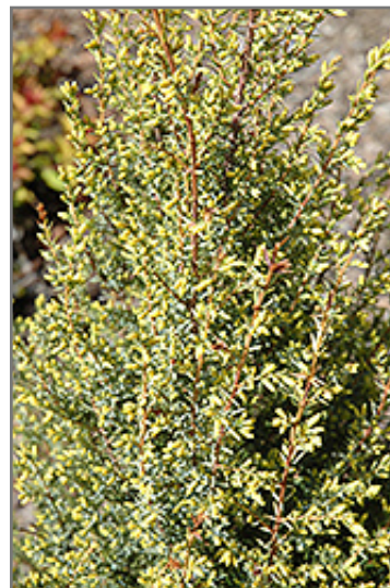
Gold Cone Juniper foliage