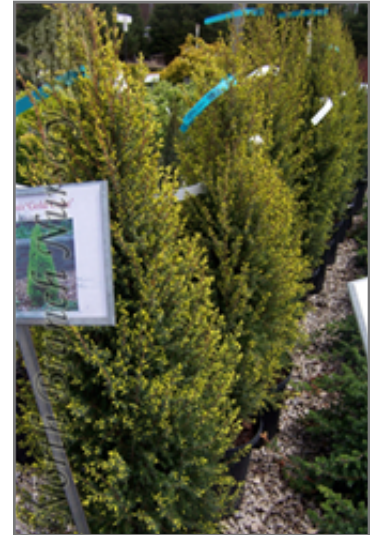
Gold Cone Juniper

This shrub does best in full sun to partial shade. It is very adaptable to both dry and moist growing conditions, but will not tolerate any standing water. It is considered to be drought-tolerant, and thus makes an ideal choice for xeriscaping or the moisture-conserving landscape. It is not particular as to soil type or pH. It is highly tolerant of urban pollution and will even thrive in inner city environments. This is a selection of a native North American species.