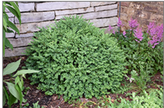
Chicagoland Green Boxwood