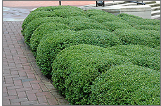
Chicagoland Green Boxwood