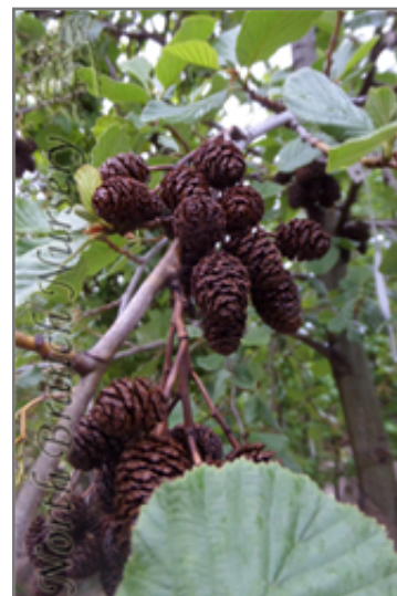
Black Alder

This tree does best in full sun to partial shade. It is quite adaptable, preferring to grow in average to wet conditions, and will even tolerate some standing water. It is not particular as to soil type or pH. It is somewhat tolerant of urban pollution. Consider applying a thick mulch around the root zone in winter to protect it in exposed locations or colder microclimates. This species is not originally from North America.