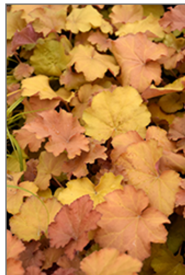
Caramel Coral Bells foliage

Caramel Coral Bells is recommended for the following landscape applications;