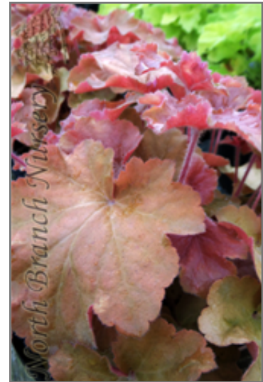
Caramel Coral Bell

Caramel Coral Bells is a fine choice for the garden, but it is also a good selection for planting in outdoor pots and containers. It is often used as a 'filler' in the 'spiller-thriller-filler' container combination, providing a mass of flowers and foliage against which the larger thriller plants stand out. Note that when growing plants in outdoor containers and baskets, they may require more frequent waterings than they would in the yard or garden.