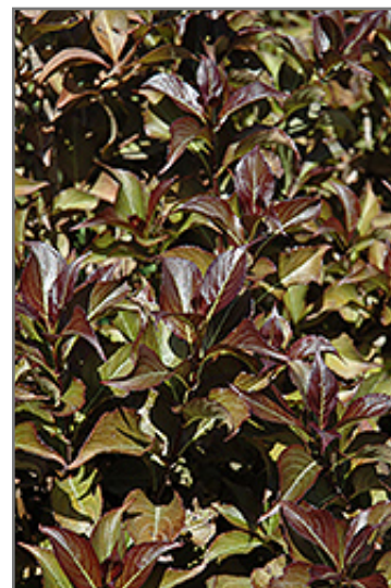
Dark Horse Weigela foliage

Dark Horse Weigela makes a fine choice for the outdoor landscape, but it is also well-suited for use in outdoor pots and containers. Because of its height, it is often used as a 'thriller' in the 'spiller-thriller-filler' container combination; plant it near the center of the pot, surrounded by smaller plants and those that spill over the edges. It is even sizeable enough that it can be grown alone in a suitable container. Note that when grown in a container, it may not perform exactly as indicated on the tag - this is to be expected. Also note that when growing plants in outdoor containers and baskets, they may require more frequent waterings than they would in the yard or garden.