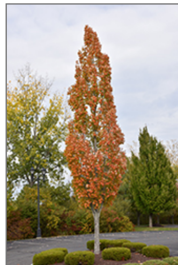
Armstrong Maple in fall

This tree should only be grown in full sunlight. It is quite adaptable, preferring to grow in average to wet conditions, and will even tolerate some standing water. It is not particular as to soil type or pH. It is highly tolerant of urban pollution and will even thrive in inner city environments. This particular variety is an interspecific hybrid.