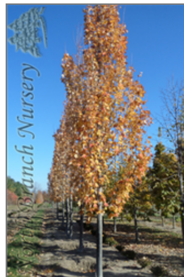
Armstrong Maple Fall Color