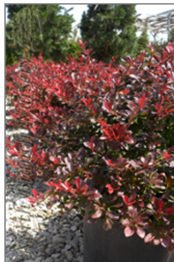
Crimson Pygmy Barberry