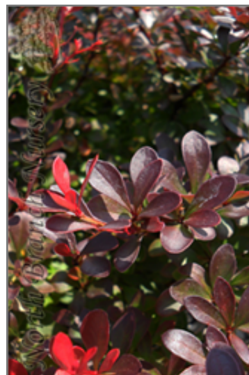
Crimson Pygmy Barberry

Crimson Pygmy Japanese Barberry is recommended for the following landscape applications;