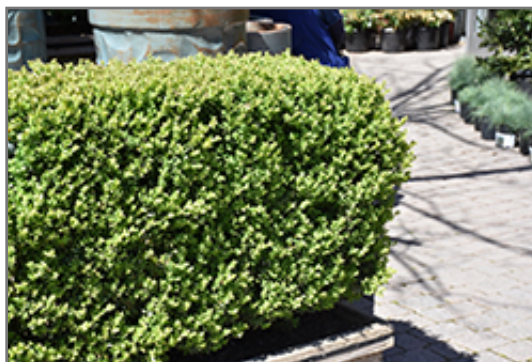
Green Mountain Boxwood