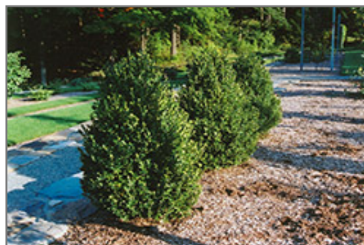
Green Mountain Boxwood