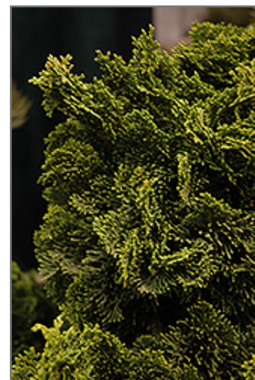
Dwarf Hinoki Falsecypress foliage