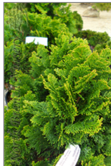
Nana Gracilis Falsecypress

Dwarf Hinoki Falsecypress makes a fine choice for the outdoor landscape, but it is also well-suited for use in outdoor pots and containers. With its upright habit of growth, it is best suited for use as a 'thriller' in the 'spiller-thriller-filler' container combination; plant it near the center of the pot, surrounded by smaller plants and those that spill over the edges. It is even sizeable enough that it can be grown alone in a suitable container. Note that when grown in a container, it may not perform exactly as indicated on the tag - this is to be expected. Also note that when growing plants in outdoor containers and baskets, they may require more frequent waterings than they would in the yard or garden.