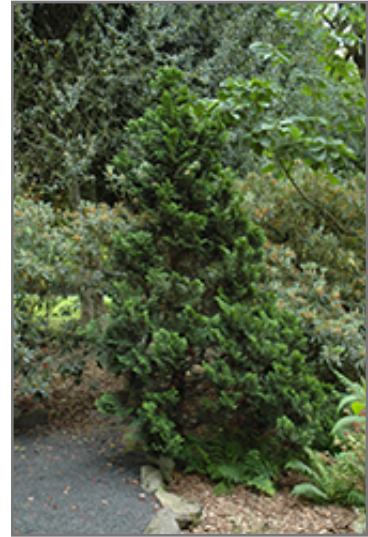
Nana Dwarf Hinoki Falsecypress

Nana Dwarf Hinoki Falsecypress is recommended for the following landscape applications;