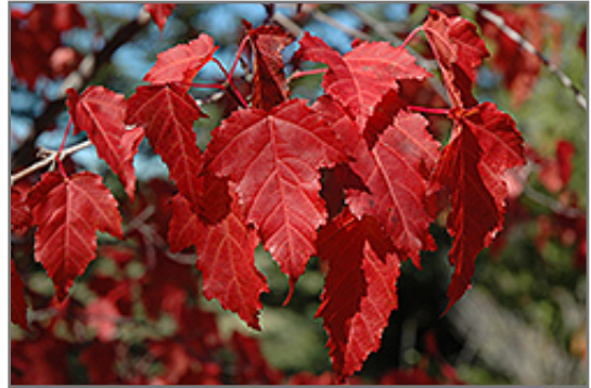
Amur Maple in fall