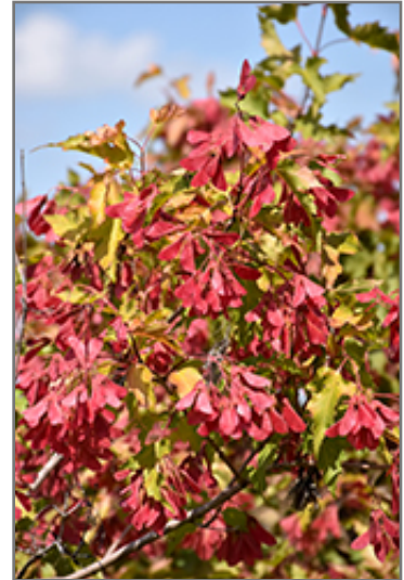
Amur Maple fruit

This tree does best in full sun to partial shade. It is very adaptable to both dry and moist locations, and should do just fine under average home landscape conditions. It is not particular as to soil type or pH. It is highly tolerant of urban pollution and will even thrive in inner city environments. This species is not originally from North America.