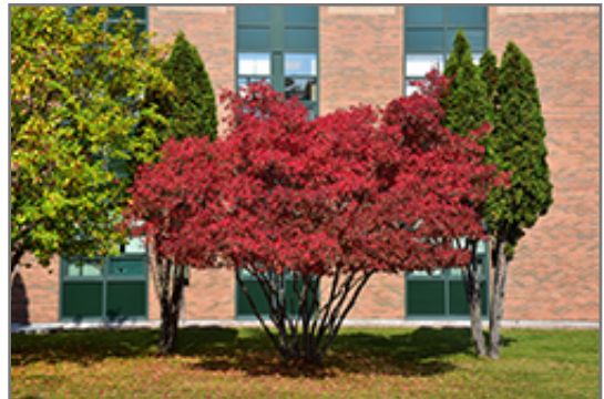
Amur Maple in fall